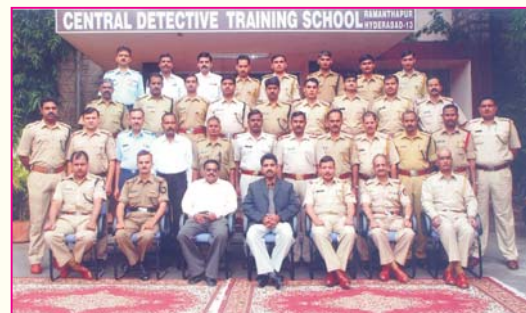
A group of officers participated in the course on Juvenile and Human Rights at CDTs Hyderabad from 13.10.2008 to 17.10.2008

The Central Detective Training Schools at Chandigarh, Kolkata and Hyderabad organized following courses on investigation for the Sub-Inspectors and Assitt. Sub-Inspectors of States Police forces during the month of September-October, 2008:-