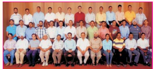
Participants of the Course on Human Rights & Crime against Women held at CDTs, Chandigarh from 15.09.08 to 19.09.08