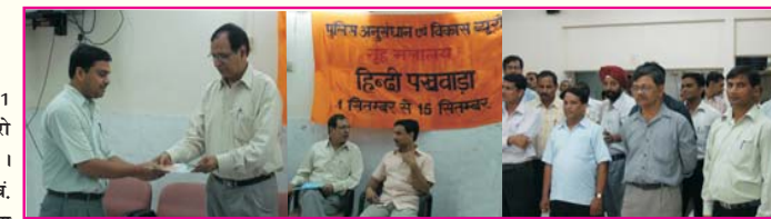
सितम्बर 2008 में पु० अनु० एवं० विकास ब्यूरो मुख्यालय में हिन्दी पखवाड़े का आयोजन

दिनांक 15 सितम्बर 2008 को ब्यूरो मुख्यालय में एक समारोह आयोजित किया गया जिसकी अध्यक्षता निदेशक (अनु. एवं. विकास) ने की। प्रतियोगिताओं में प्रथम तीन स्थान प्राप्त करने वालों को क्रमशः ₹ 1500/-, 1250/- तथा 1000/- के नकद पुरस्कार के साथ प्रमाण-पत्र व हिन्दी साहित्य प्रदान किया गया। ब्यूरो के चतुर्थ श्रेणी के कर्मचारियों को भी प्रोत्साहित करने के लिए उन्हें भी नकद पुरस्कार व प्रमाण-पत्र से सम्मानित किया गया। इस अवसर पर माननीय गृह-मंत्री जी द्वारा राजभाषा हिन्दी के प्रयोग को प्रोत्साहित करने हेतु जारी की गई अपील पढ़ी गई। अध्यक्ष महोदय ने अपने संबोधन में सभी अधिकारियों एवं कर्मचारियों से अपना अधिकाधिक सरकारी कामकाज हिन्दी में करने की अपील की तथा पुरस्कार विजेताओं को शुभकामनाएं दी।